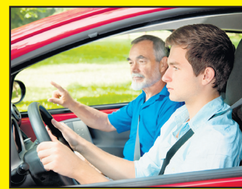
WHEEL DEAL: Driving lessons

● OR GET two one-hour driving lessons for €25 (58 per cent off) from the Brera Driving School for south Dublin. Call