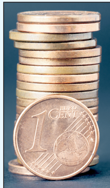
TOSSED: Coppers are on way out

So if your bill comes to €9.21 or €9.22 you will only have to pay €9.20 while if it is €9.23 or €9.24 it will be €9.25. Banks are now collecting these coins for a variety of charities — please support this.